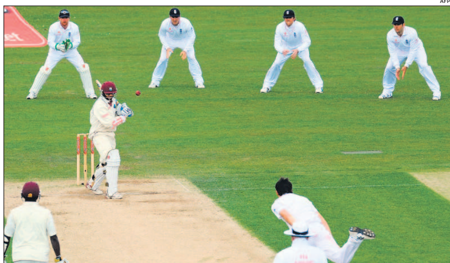
Opinions are divided over whether the traditional five-day Tests should be reduced to four days

New Delhi: This might be a tough ask. If you are a Test cricket buff, set aside, for an instant, the associated sentiments. Forget the indulgent, intellectual delights of absorbing five days of nuanced interplay between bat and ball. The thrill of watching even an absorbing draw, the mythology of unforgettable past contests. Forget the wisdom in tampering with the credentials of a classic format. Or the ethics involved in messing with the aura of tradition.