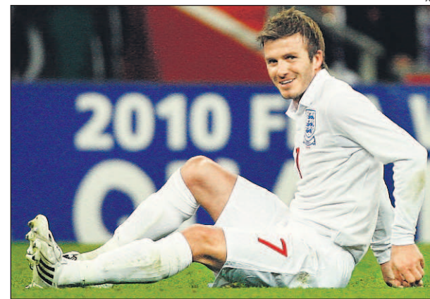
OUT OF FAVOUR: David Beckham has been called a 'lousy captain' and 'tightwad' by his Los Angeles Galaxy teammates

"By July 2008, the LA players had seen enough to realise that Beckham might be a good teammate - but he wasn't much of a captain. It's one thing to take part in team events, but it's another thing to lead, to rally the players during tough times," Donovan said. "When Gullit gave the players an optional training day, Beckham didn't show up. As captain you should at least come in and show your face."